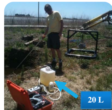
Figure 2. Field Sampling w/ water collection pump in foreground and dredge sampler in background

The Western Institute for Food Safety and Security research team (WIFSS) enlisted branch offices of the NRCS and other stakeholders in three states (California, Mississippi and Florida) to secure access to farms with constructed sediment basins and tail-water recovery systems. To preserve grower cooperation and confidentiality, no record of farm ownership or specific location was included in the dataset. Outside California, all of the enrolled farms used tail-water recovery systems. We adapted a high-volume filtration method (Polaczyk et al., 2008) to detect the presence of pathogens ( E. coli O157:H7, Salmonella ) enabling us to analyze a greater volume of water (20 L) than is done under normal sampling regimes (100 mL) (Figure 2). A