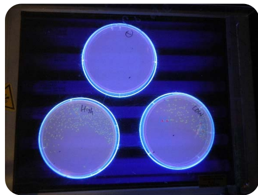
Figure 3. UV image of agar plates confirming the presence of pathogenic bacteria in a sample.

Water samples were concentrated from 20L to 300-1000 mL retentate samples using high-volume ultrafiltration. Retentates were processed for E. coli O157:H7 and Salmonella using a protocol described by Cooley et al. (2007) with the following modifications: 30 g/L of tryptic soy broth (TSB) powder was added directly into the Nalgene bottle containing the retentate and enriched for 2 hours at 25°C and 100 rpm, 8 hours at 42°C and 100 rpm and held at 4°C until processed with immunomagnetic separation the presence/absence of E. coli O157:H7 and Salmonella (Figure 3). All presumptive positive samples were biochemically confirmed.