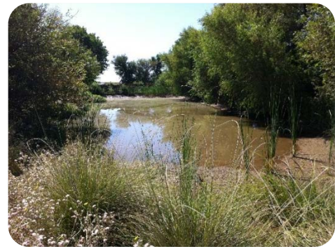
Figure 1. Example of a California sediment basin used during this study.

Sediment basins (Figure 1) on irrigated agricultural sites are an important Conservation Practice (CP) meant to capture and detain sediment laden runoff for a sufficient length of time for sediment settling prior to discharge. Accumulated sediment may be periodically removed and redistributed to adjacent fields, the regularity of which is determined by the basin's sediment holding capacity. It is well established that sediments associated with standing water are microbiologically rich, capable of harboring bacteria in far excess of the overlying water. The purpose of this study was to examine the potential microbiological impact a properly installed sediment basin may have on nearby produce fields. Additionally we examined whether algal mats formed along the edges of sediment basins and/or drainage ditches were additional reservoirs of pathogenic bacteria. Over the course of one year we sampled sediment basins and tail-water recovery systems, both NRCS and non-NRCS engineered, to determine which factors may contribute to the occurrence and persistence of bacterial pathogens in sediment and algal mats.